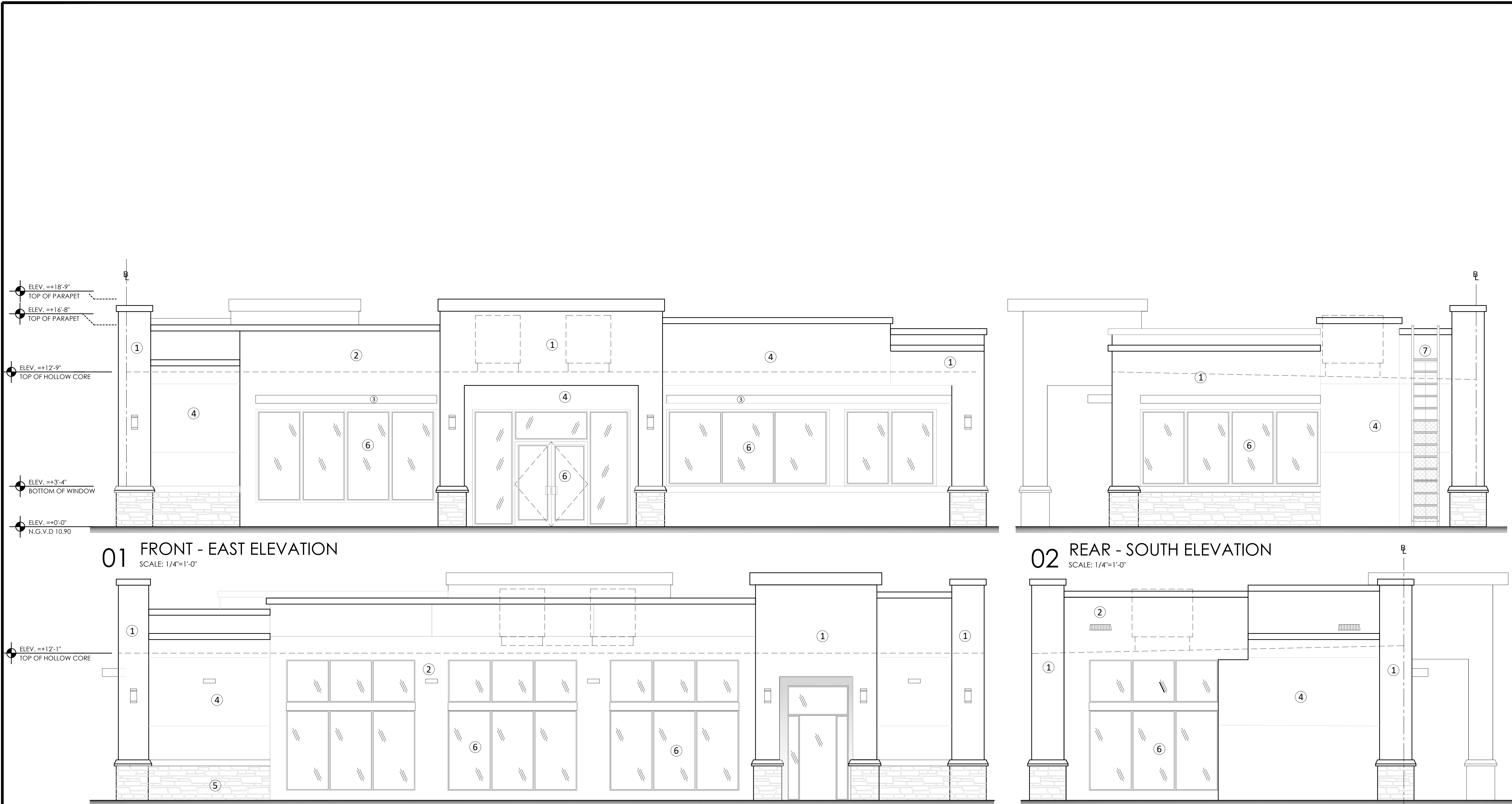
01 FRONT - EAST ELEVATION SCALE: 1/4"=1'-0"